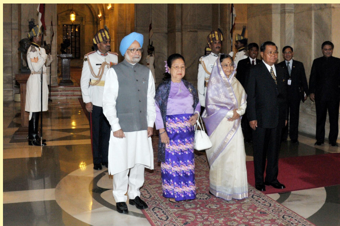
President and Prime Minister of India welcome visiting Chairman, State Peace and Development Council of Myanmar, and Daw Kyaing Kyaing in New Delhi on July 27, 2010