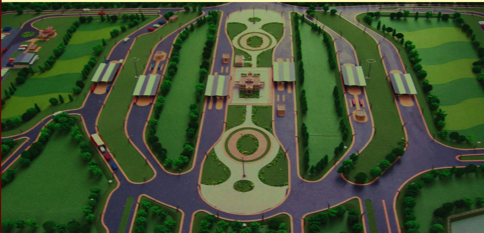
Left: Scale model of the processor building being built at Raxaul ICP