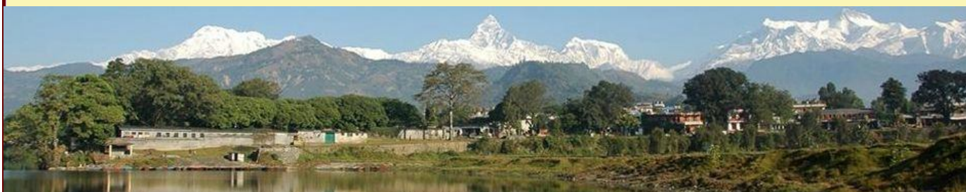
View of the majestic Annapurna mountain range from Pokhara, Nepal

Government of Nepal has launched Nepal Tourism Year 2011 (NTY2011) campaign, aiming to achieve the target of one million tourist arrivals per year. NTY 2011 also aims to establish Nepal as a prime holiday destination. With the slogan " Together for Tourism ", the campaign will open new products and activities, offers new tourism packages and will make every possible effort to make the stay of the visitors memorable. To make NTY2011 campaign successful, Government of Nepal has decided to appoint Everest Summiters as NTY 2011 Honorary Goodwill Ambassadors. Letters of Appointment were handed over to some of the summiters present to celebrate the 3 rd International Everest Day in Kathmandu on May 29, 2010. Government would also provide a free visa to Mt. Everest and Mt. Dhaulagiri Summiters from May 2010 to December 2011. ( Source: Embassy of Nepal, Bangkok )