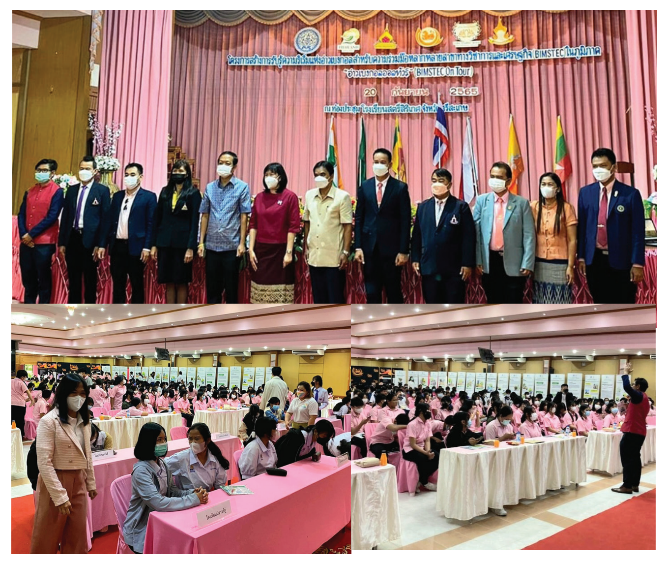
Photographs from the "BIMSTEC on Tour" programme involving reach out to high school students in Thailand to create awareness about BIMSTEC.