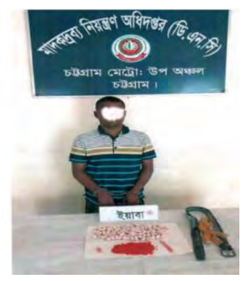
20000 pieces methamphetamine (yaba) were seized by Dhaka Intelligence Office, DNC.

This committee comprises of all law enforcing agencies and intelligence agencies of the country.