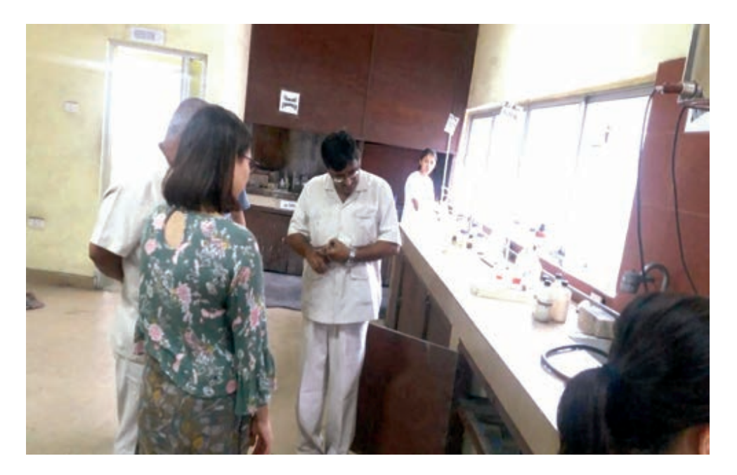
Auditing of precursor chemicals in Industrial estates