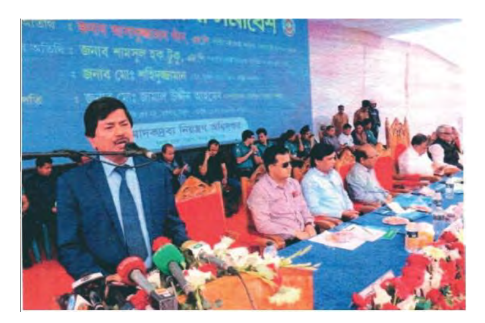
Honourable Secretary, Security Services Division, Ministry of Home Affairs is delivering speech in an anti-drug campaign