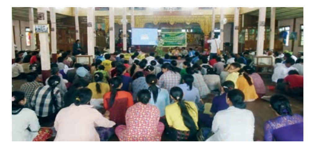
Agricultural Extension Training

Organizing 419 talks and 178 training courses on livestock breeding which covered 3,850 and 178 participants respectively, and distribution 53 types pamphlets and 8,478 leaflets on livestock breeding in 4 States.