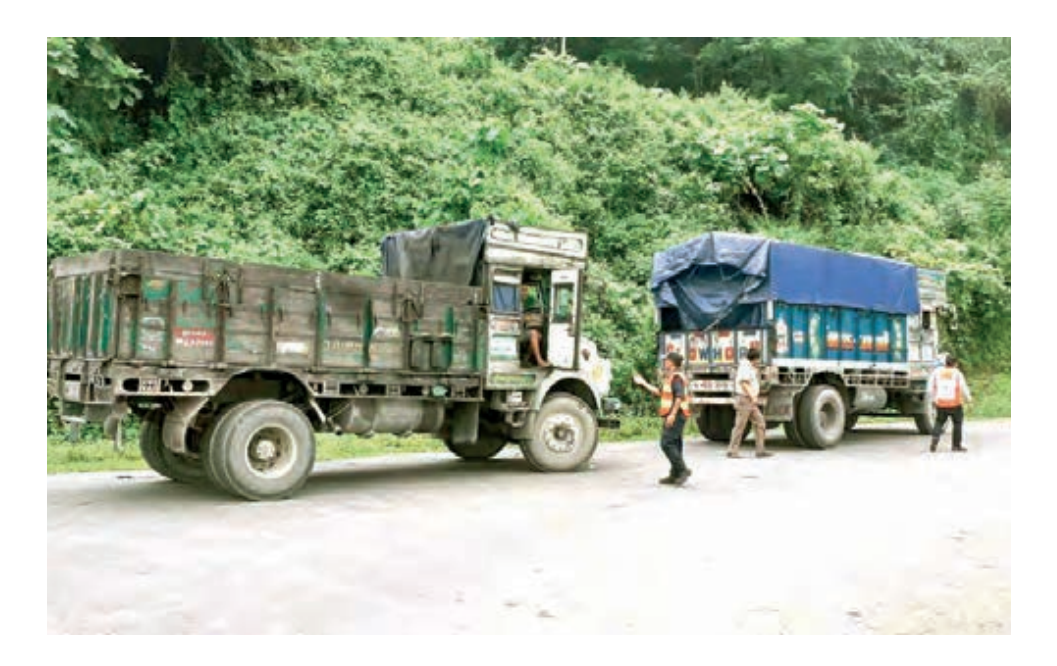
Inspections of controlled drugs along the Highways