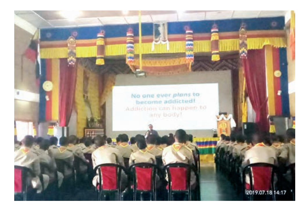
Drug Sensitization program for Scouting Leaders