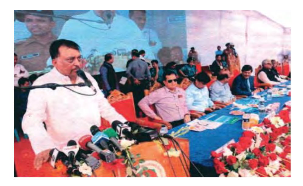
Honourable Secretary, Ministry of Home Affairs is delivering speech in an anti-drug campaign