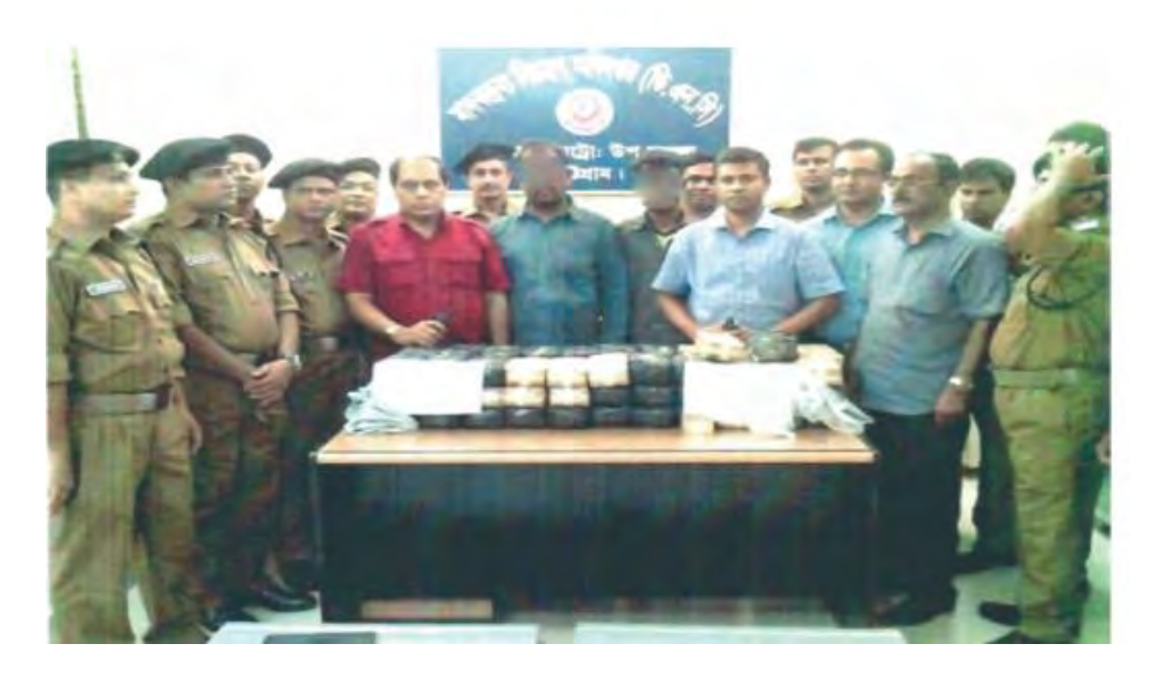
DNC officials seized 680000 pieces of methamphetamine (yaba)