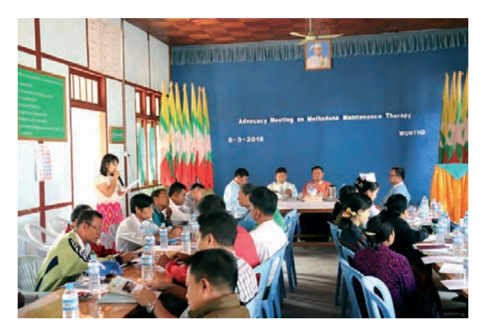
Advocacy Meeting on Methadone Maintenance Therapy

The total number of patients who received Methadone Maintenance Therapy was 37,526 and of whom 6,372 patients were newly admitted ones.