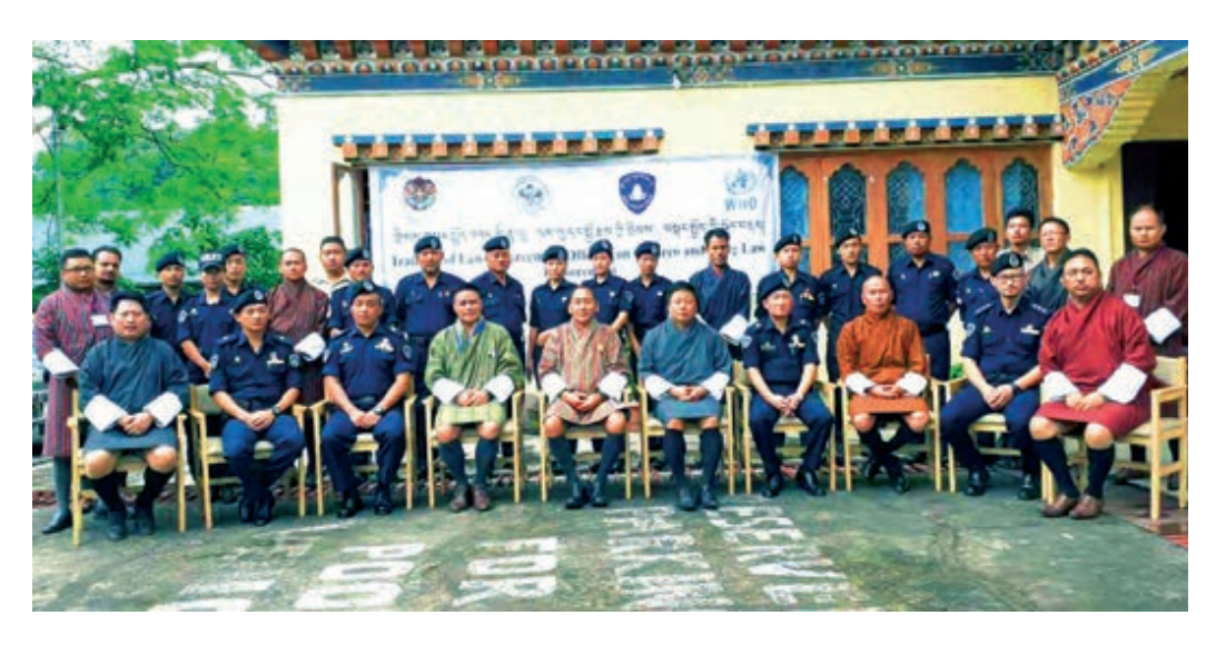
Training of Regional Law enforcement Officials