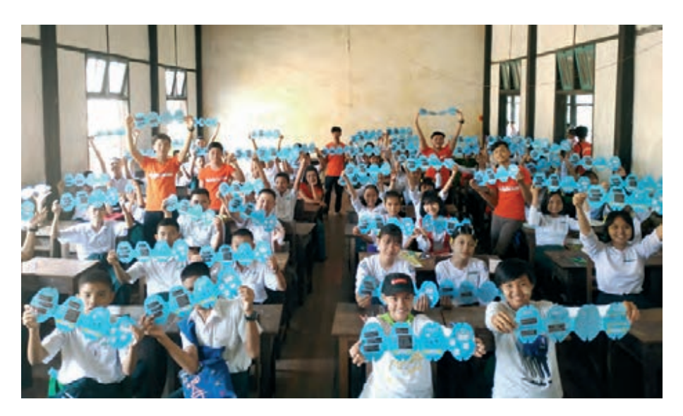
Making the Right Choice, Methamphetamine Use Prevention Campaign

The dire consequences of illicit drug use are included in the life skills curriculum in the schools to raise awareness since early education. The risk of drug abuse is also taught to out of school students who are pursing non-formal education.