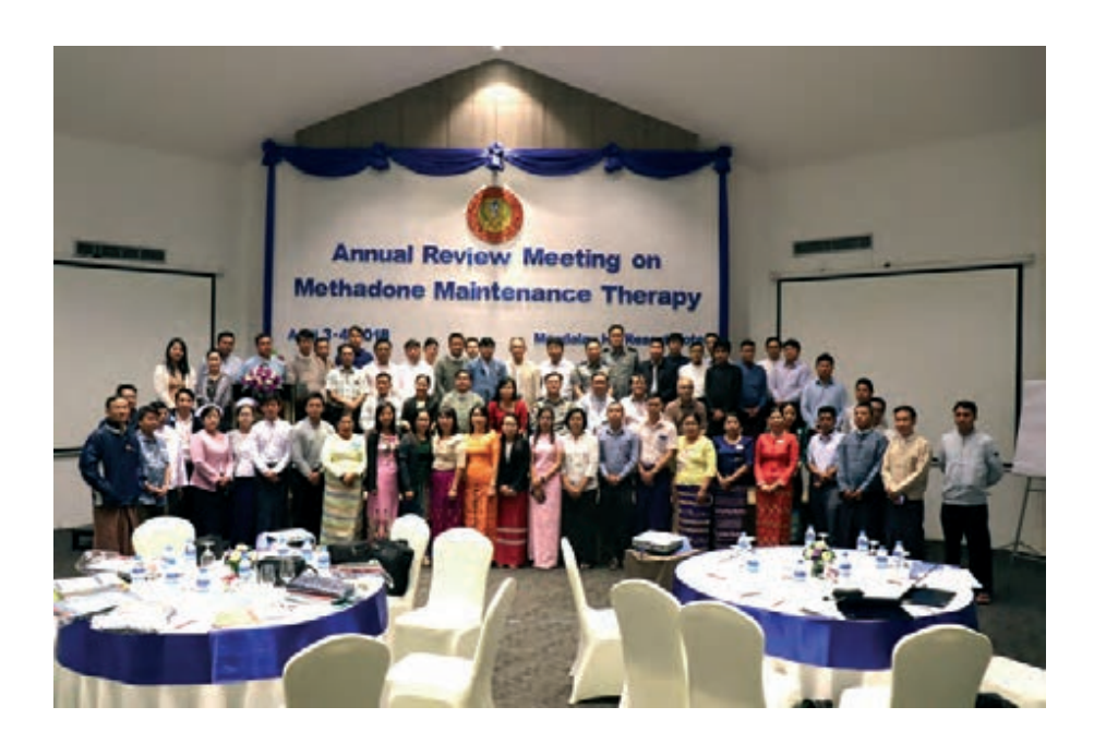
Annual Review Meeting on Methadone Maintenance Therapy

The Drug Dependency Treatment and Research Unit of the Ministry or Health and Sports is providing drug prevention, treatment and health care services to drug addicts in 26 major drug treatment centers, 47 minor drug treatment centers and 55 methadone dispensing sites across the country.