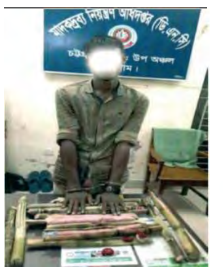
DNC officials seized 680000 pieces of methamphetamine (yaba)