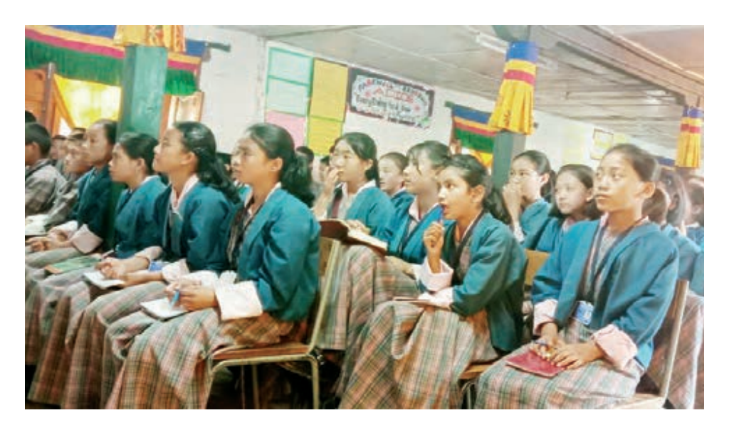
Drug Education Program for students in schools