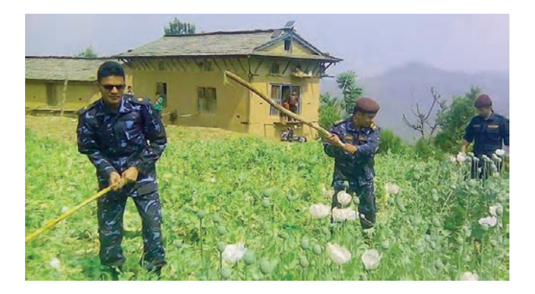
Destroying Illicit Cultivation of Opium in Baglung